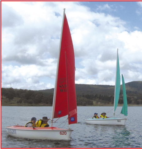
Greg and Peter (Jade) are creeping up on the Pittwater boat (red sails) in very light wind at Lake Wallace.